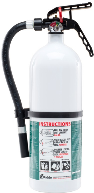
Kidde Disposable Fire Extinguisher with plastic valve