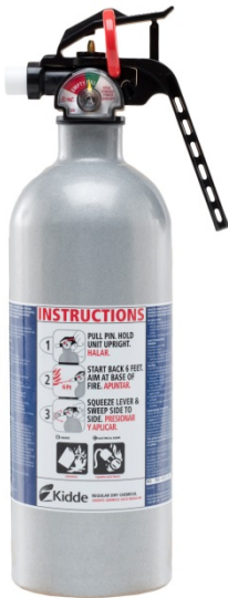
Kidde Disposable Fire Extinguisher with plastic valve